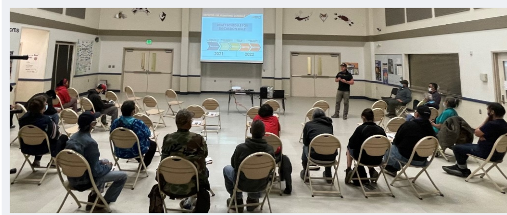
Community meeting in Noorvik, August 11, 2021