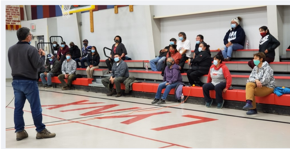
Community meeting in Kiana, August 10, 2021